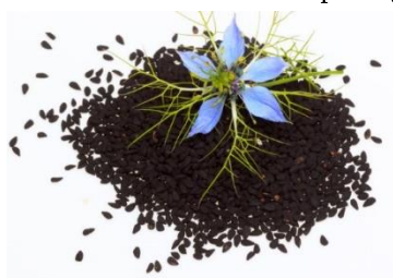
Figure 1: Nigella sativa

Plants can be considered as factories producing various chemical compounds. Many of them are used to prevent diseases, and some of them are used as medicine or food [1]. Herbal medicines have long been used for different diseases [2]. Recently, the production of new products from natural plant sources has been considered. It is estimated that there are 300000 plant species in the world, of which only 15% have been studied in terms of medicinal potential [3]. One of the most valuable medicinal plants is Nigella Sativa , which are small seeds rich in many nutrients [4]. Nigella sativa from the Ranunculaceae family is an annual plant that grows in the Mediterranean region and widely in India, Turkey, Pakistan, and southern Europe [Figure 1] [5].